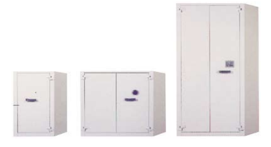
AF II security cabinets are available in three sizes

AF II cabinets are constructed using sheet steel for the body and double-panelled, 65mm-thick doors. The rounded door bolts are 20mm in diameter and protected by a relocking system which blocks the boltwork in the event of an attack.